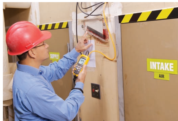
Confirming pressure drop across the air filter bank.

The Fluke 922 can be used with a choice of pressure sensing devices to check pressure drop across an airside device. If the approach to and from the device is straight, a Pitot tube can be placed on each side of the device and the difference in total pressure readings will result in pressure drop. The tube connected to the upstream side Pitot tube is connected to the 922 "+" port, the tube connected to the downstream side Pitot tube is connected to the "-" port, the pressure reading displayed will be the device pressure drop. If the approach is not straight to the device, then use the static sensing side of the two Pitot-Static tubes, or use two static pickups connected to the meter in the same manner.