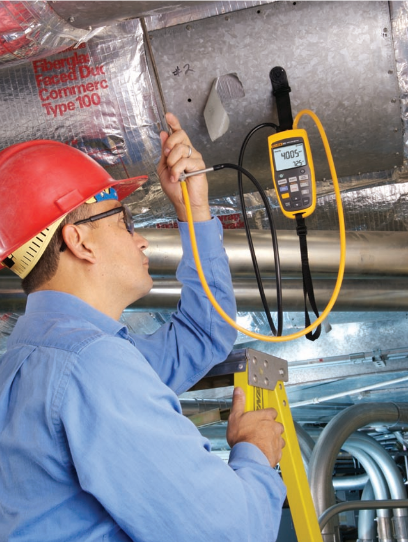
Using the Fluke 922 low pressure differential meter in a duct traverse.

Of the many different low pressure measuring instruments used over the years, electronic manometers/micromanometers (very low pressure gauges) now offer durability, precision, accuracy, and the significant time saving convenience of fully automatic calculations as well as minimum-maximum-average and memory functions.