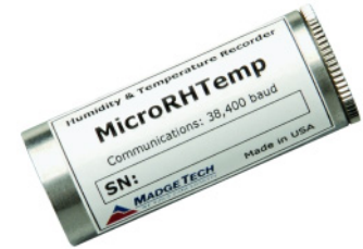
*Actual size shown

The MicroRHTemp is a battery powered, stand alone humidity and temperature recorder that can fit in the tightest places. It is even small enough to fit into most pill bottles. It features an LED alarm indicator that alerts when user-chosen temperature limits are exceeded. This all-in-one compact, portable, easy to use device will measure and record up to 16,383 measurements per channel. The storage medium is non-volatile solid state memory, providing maximum data security even if the battery becomes discharged. Start and stop the device directly from your computer and data retrieval is quick and easy. Simply plug it into an empty COM or USB port and our user-friendly software does the rest.