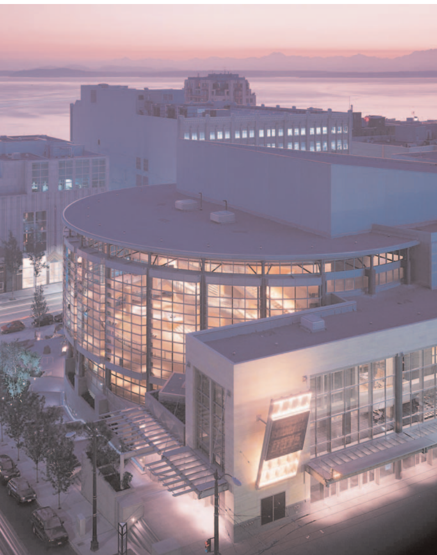
Benaroya Hall, home of the Seattle Symphony